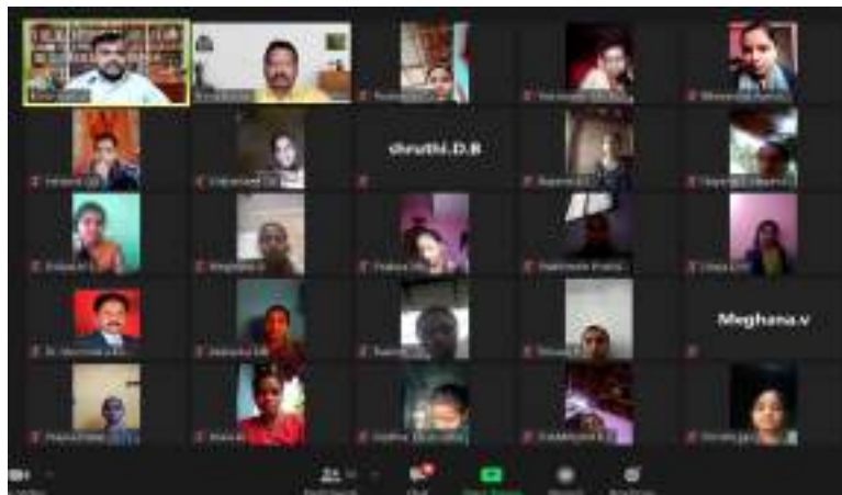
Student Teachers and Faculty Members involved in the orientation session